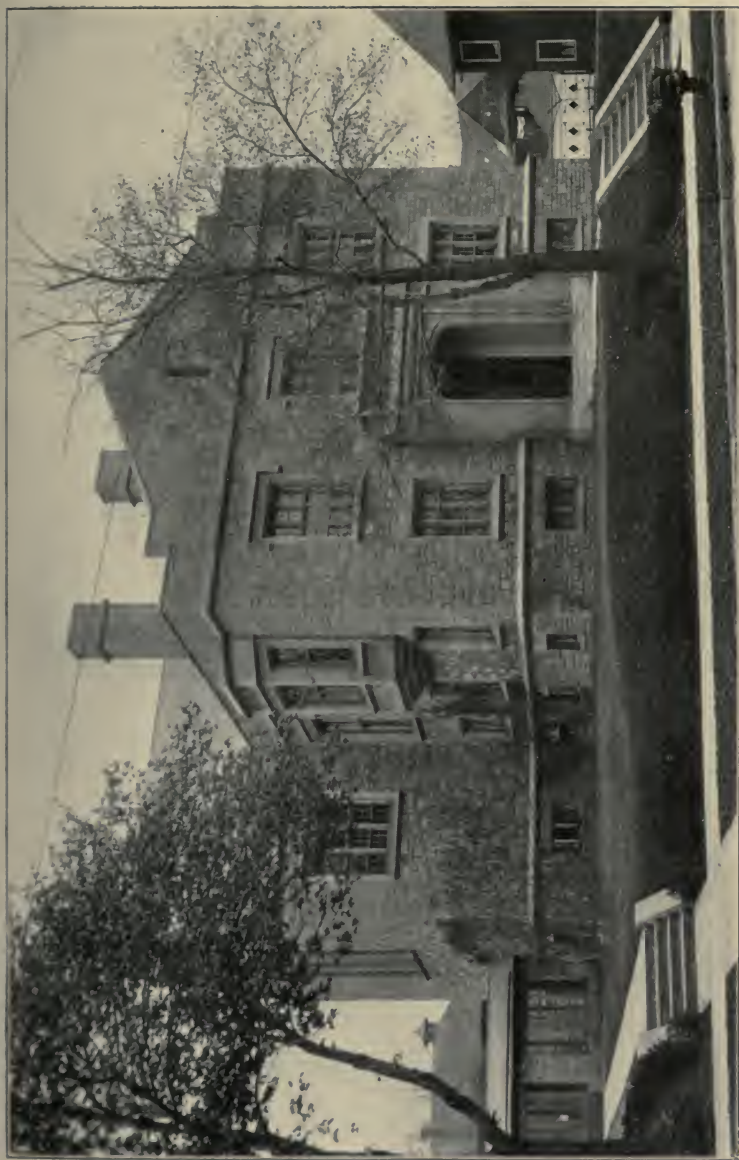
THE SUSAN B. ANTHONY MEMORIAL BUILDING At Rochester (N. Y.) University.