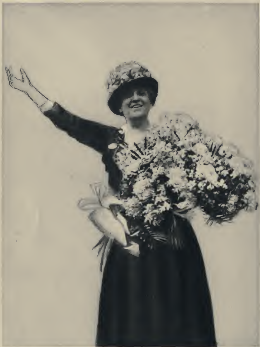
MRS. CARRIE CHAPMAN CATT.

President of the International Woman Suffrage Alliance from its founding in 1904 and of the National American Woman Suffrage Association 1900-1904 and from 1915.